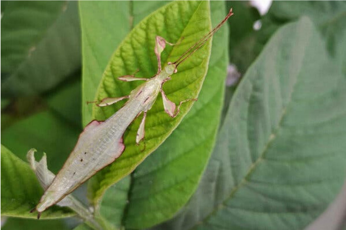
A male Phyllium asekiense .

The technicians offered the nymphs a buffet of fragrant guava, bramble and salal leaves. Two nymphs refused to eat and soon died. The remaining three munched on bramble, molted, munched, molted, and molted some more. One nymph grew green and broad, just like her mother.