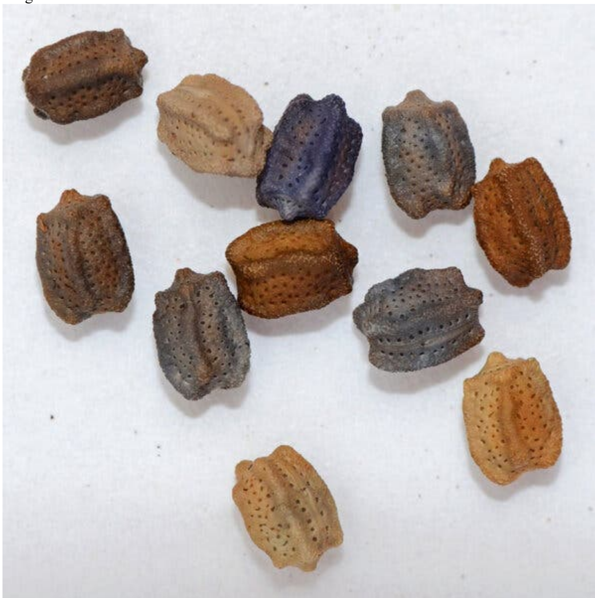
Eggs of P. asekiense in the Montreal Insectarium lab.