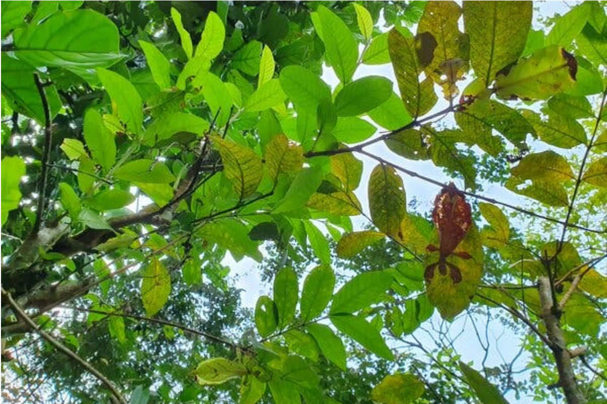
Leaf insects are notoriously hard to spot. For instance, this image shows nine.