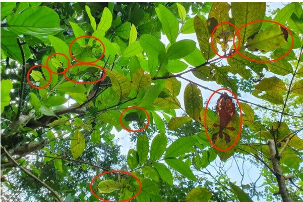
The same photo, but with all nine leaf insects circled in red.

At the Montreal Insectarium, the two male Nanophyllium s flew day and night for four months and died before their female sibling matured. She lived for nine months, laying 245 eggs in Easter egg pastels: blues, yellows and beiges. "To have eggs from one female in so many colors?" Mr. Le